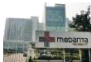
MEDANTA- THE MEDICITY, GURUGRAM