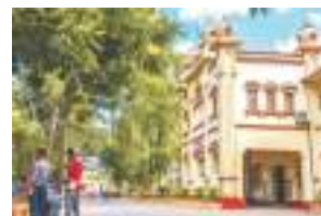
UNIVERSITY OF JAFFNA, SRI LANKA