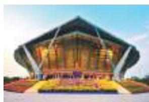
MAHIDOL UNIVERSITY BANGKOK, THAILAND